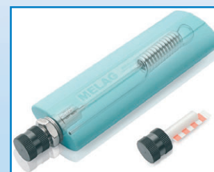
MELAcontrol ® PRO

On the basis of new general conditions of sterilization work – for example, new legislation concerning medical products and infection protection – documentation of sterilization processes has become urgently advisable. The standard EN 867-5 has defined a test receptacle for “Class B” autoclaves that simulates the most difficult requirements placed on the sterilization of long, narrow-bore instruments. MELAG offers its MELAcontrol ® PRO system for this testing purpose. It consists of a test unit, the so-called helix, into which the user inserts an indicator strip. After successful sterilization, the user documents the result and archives it for purposes of providing later evidence.